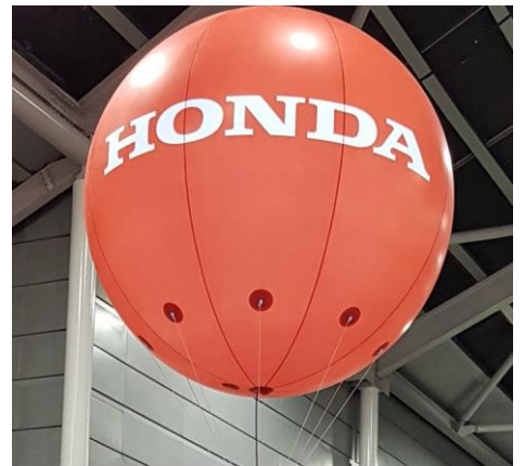
3m (full digital print)