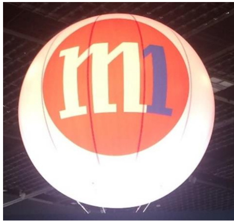
2m (2 sides printed)