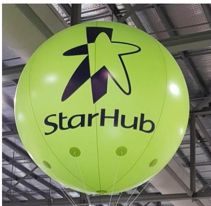
3m (full digital print)