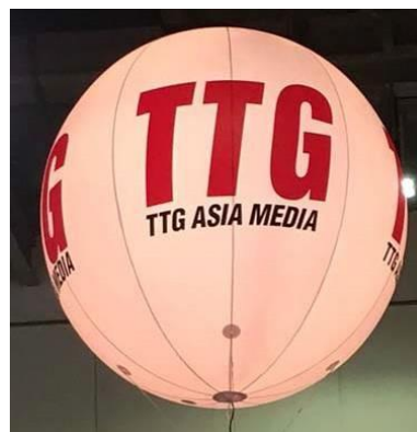
2.4m (4 sides printed)