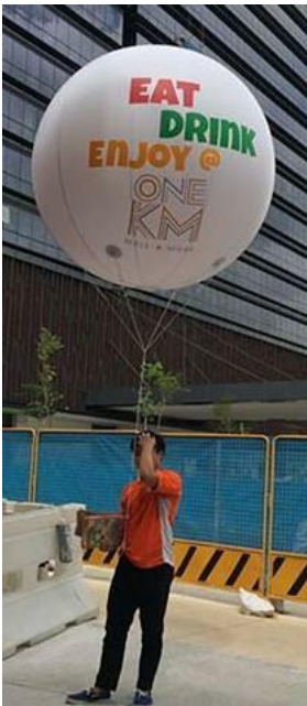
1.6M ROUND (PROTABLE)