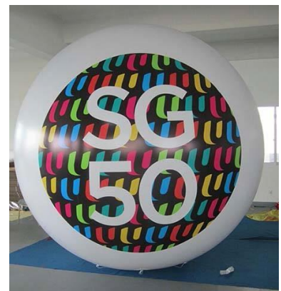
3m (2 sides printed)