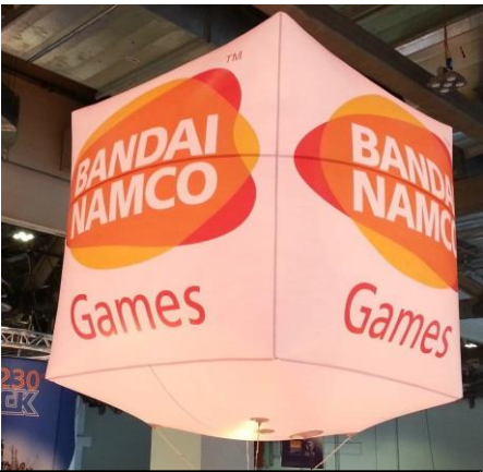
2M (4 SIDES PRINTED) (Bloated)

Size: 1 feet square Base - white cone cover - 20kg cast iron anchor weight