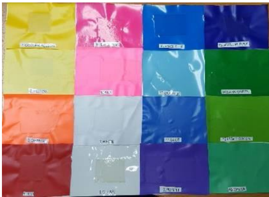
Color PVC GAB with die cut stickers