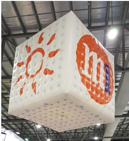
3M (4 SIDES PRINTED) (Dimples)