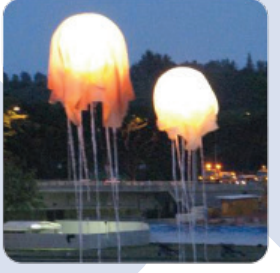
NDP 2007 (Jellyfish)