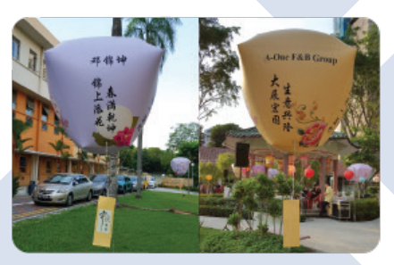
Kong Ming Lantern with LED Lights