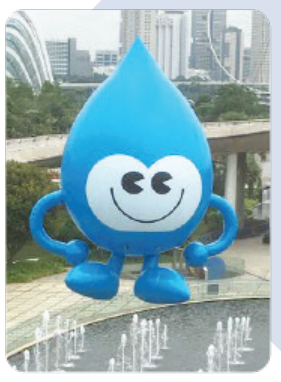
Singapore World Water Day