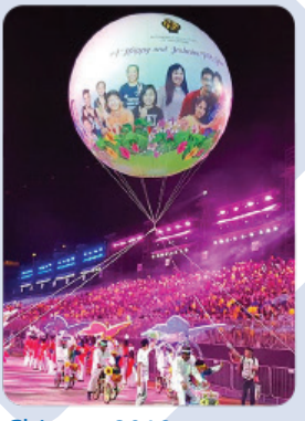
Chingay 2018 (4m dia)