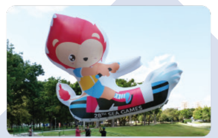
SEA Games 2015 (Nila Waterski)