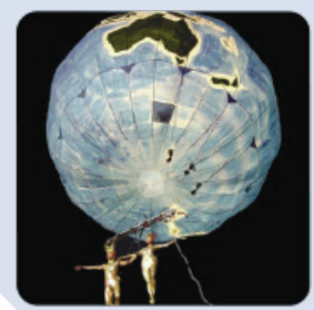
NDP 2004 (8m dia heliosphere)