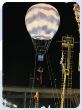
Chingay 2010 (8m dia with acrobat)